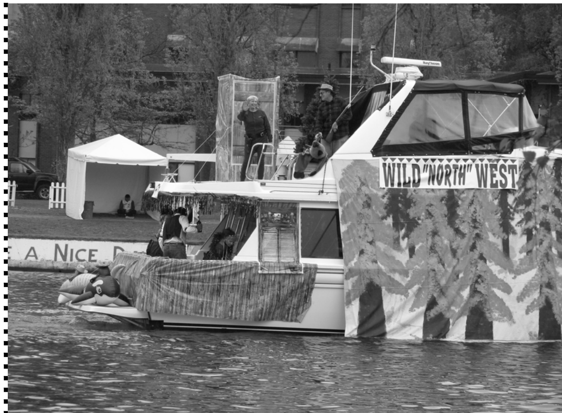
PHOTO OF THE MONTH SEATTLE OPENING DAY GHYC DECORATED BOAT WITH SKIPPER BILL TAKOS' MIANDER